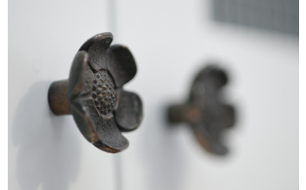
Reclaimed 1960s floor tiling (below) and cabinet handles (above) in Dempster Homestead